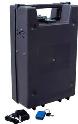
Cash Caddy -STC03