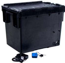
Cash Caddy/ - STC01 Courier Bin