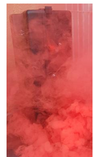
External Colour Smoke