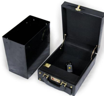
Cash Caddy – STC02