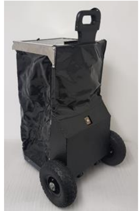
ZST-2 ALUMINIUM TROLLEY