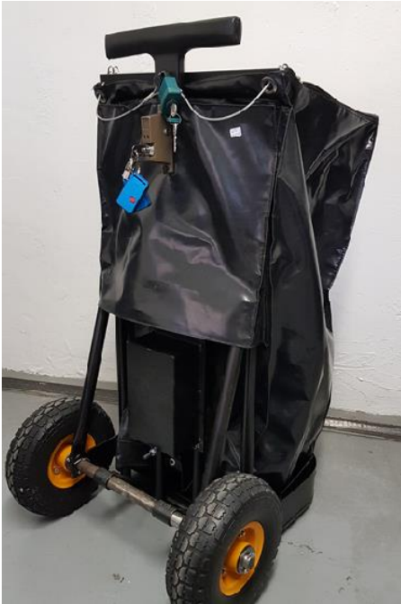
ZST-1 STEEL TROLLEY